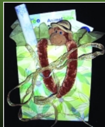
gift bag design may vary

Order now to insure delivery time or stop by your Zoo to pick one up!