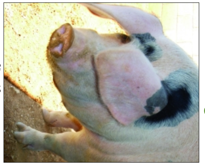
Animal Trading Card